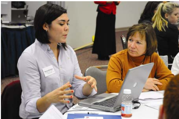
Participants listened to each other's ideas about the well-being of people, connections and collaboration, the economy, and the physical environment.