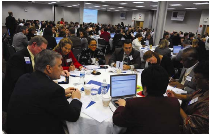
Participants at the Lancaster 2020 summit filled the room to deliberate on opportunities for creating an even more prosperous, extraordinary and caring community. People gathered at 32 tables of 10, each with a trained facilitator.